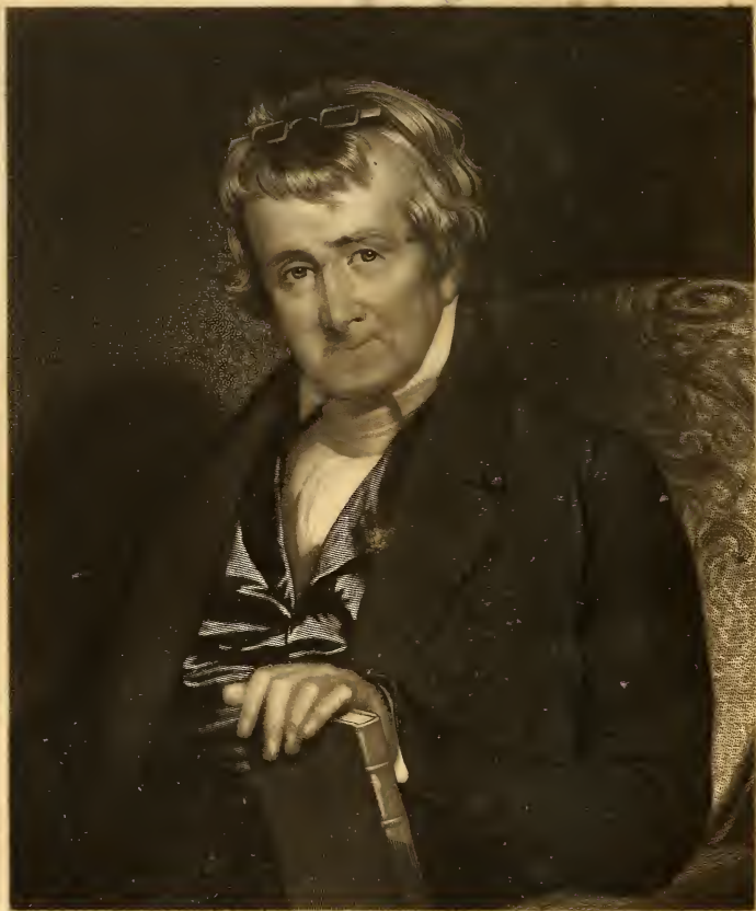
ENGRAVED BY SARTAIN. — THE ORIGINAL BY NEALE